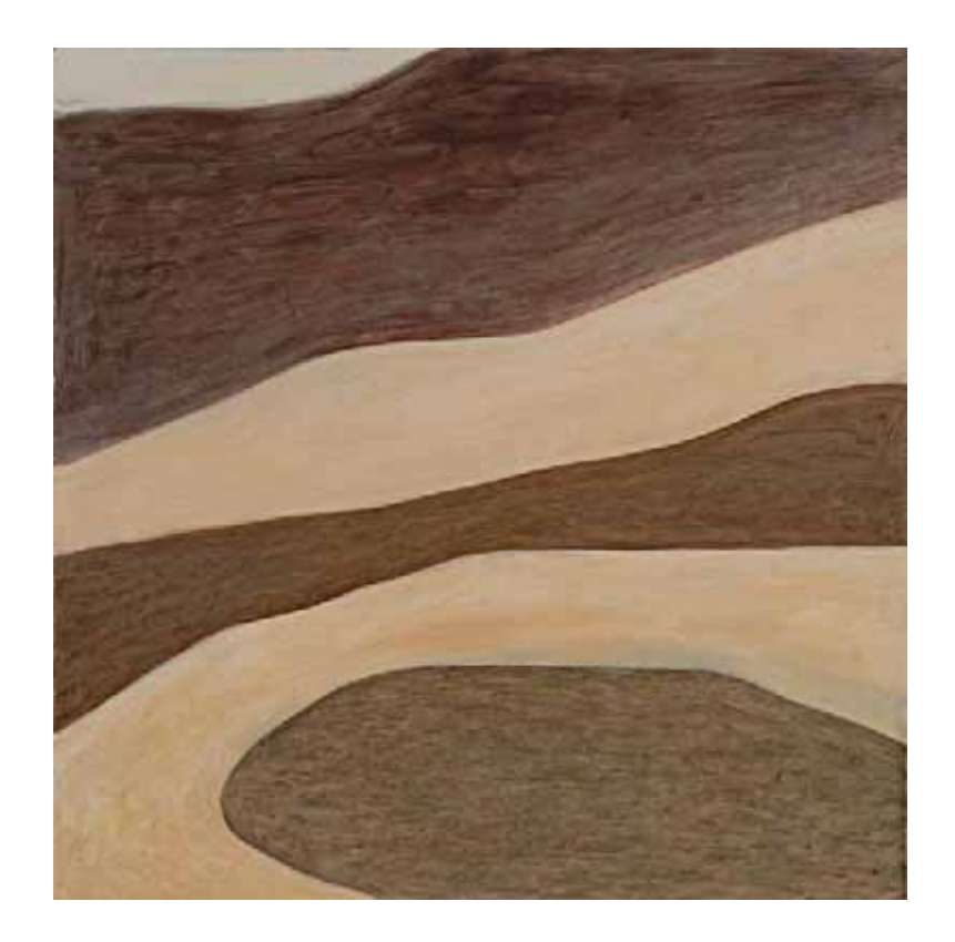
FIGURE COMPOSITION (2007) Oil on board 60 x 60 cm $3,300